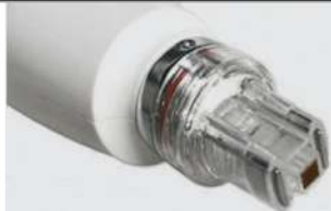
HIGH PULSE HEAD