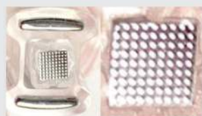
MICRO-NEEDLES THAT EXCEED THE CORNEUM LAYER INCREASING PERMEABILITY OF DERMA