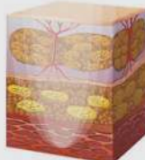
MUSCLE ELECTROSTIMULATION COMBATS EXPRESSION WRINKLES AND STIMULATES THE DRAINAGE OF LIQUIDS